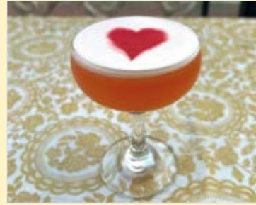
Galentine's Day at Havana 1920.

Bravolebrity-curated music playlist, and pop-up shop from Pacific Beach's Trendy & Tippy clothing and accessories store.