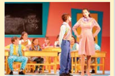
"Sideways Stories from Wayside School"

Tribute to the Reggae Legends, also known as Bob Marley Day, honors the rich legacy of reggae music at an annual two-day festival at the WorldBeat Cultural Center (2100 Park Blvd.) in Balboa Park on Feb. 21 and 22. Tickets start at $40 at tributetothelegends.com.